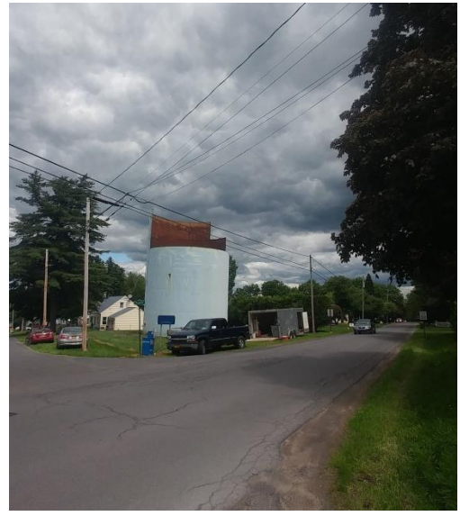
Cutting Tank Panels to Drop Inside Tank.