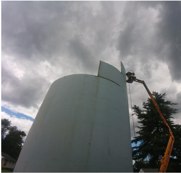
Cutting Tank Panels to Drop Inside Tank.