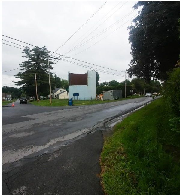
Cutting Tank Panels to Drop Inside Tank.